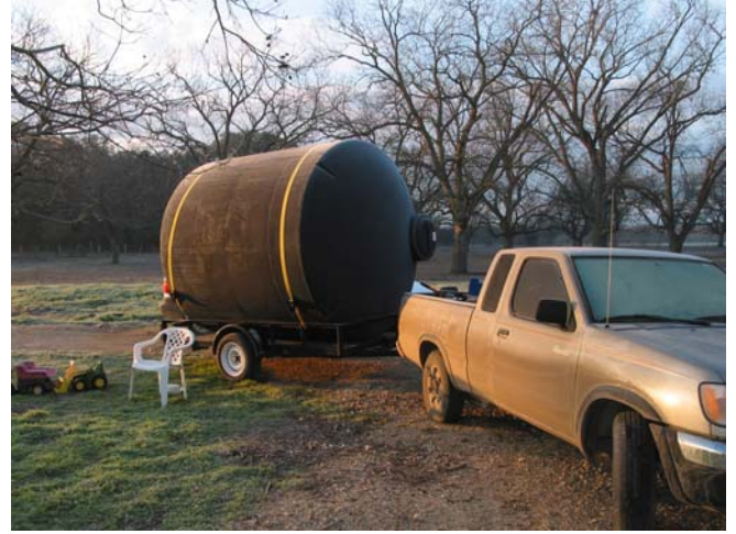
The new water storage reservoir.....It needs a little decoration

Our farm is less than 1000 feet from the Colorado River and our well is very shallow only 33 feet deep. Although we have a good water supply the depth of water we pump from is only about 2 feet when we measured it in the middle of the drought last summer. We can pump a little over 20 gallons per minute but since the water depth is so small we have to use a special pump that is not normally used in water wells to get the water out of the well. The downside to using this pump is that our water pressure is low. The one way to increase the water pressure is to install a reservoir tank/cistern to pump into out