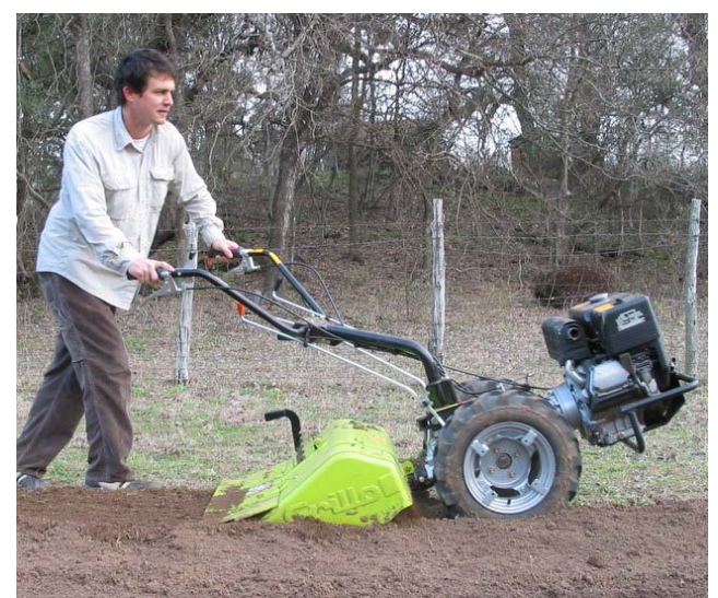
I like the new tiller but for larger areas a tractor with a roto-tiller or spader would be a lot faster!

The greenhouse is completely full.....we are planning on extending it this weekend by 8 feet on each end